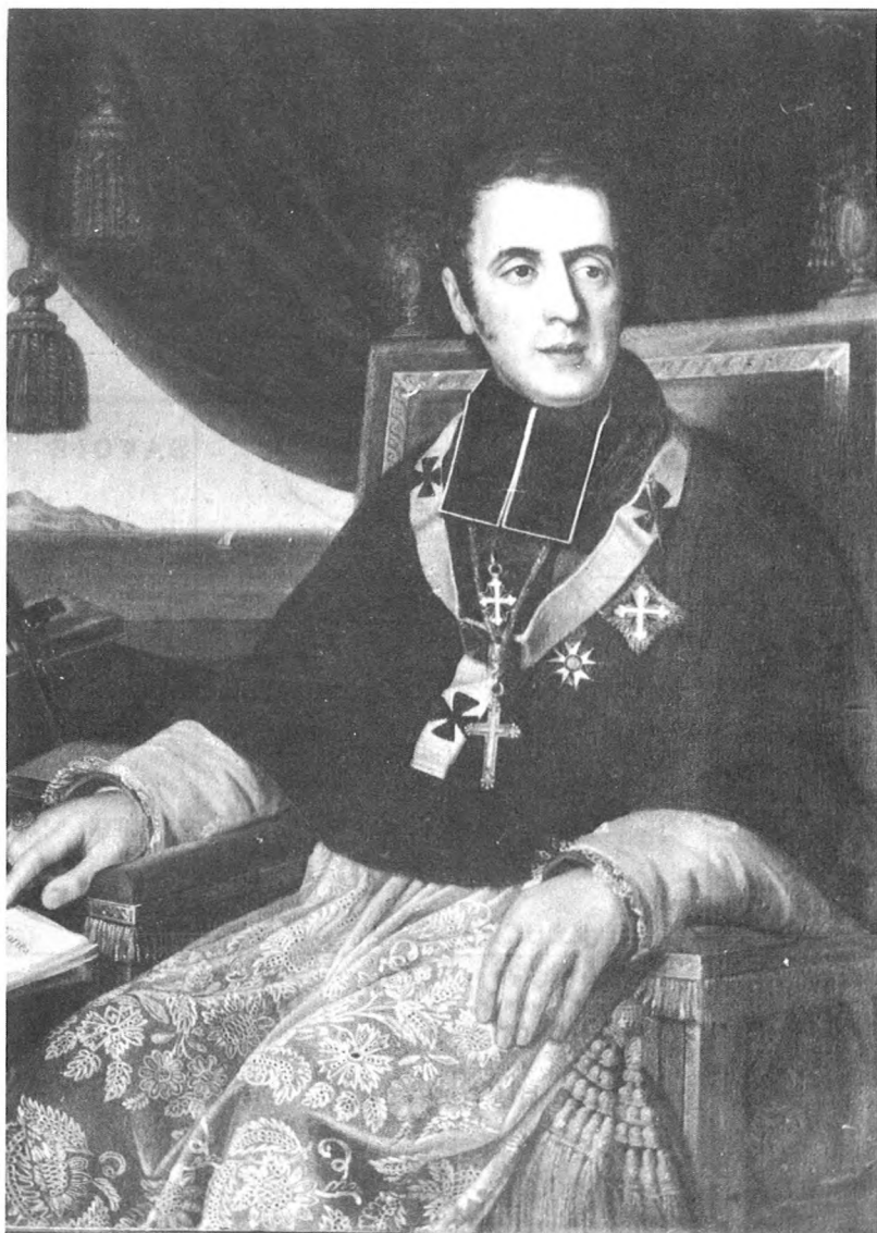
Bishop Charles Joseph Eugene de Mazenod (1782-1861) Bishop of Marseilles (1837-1861)