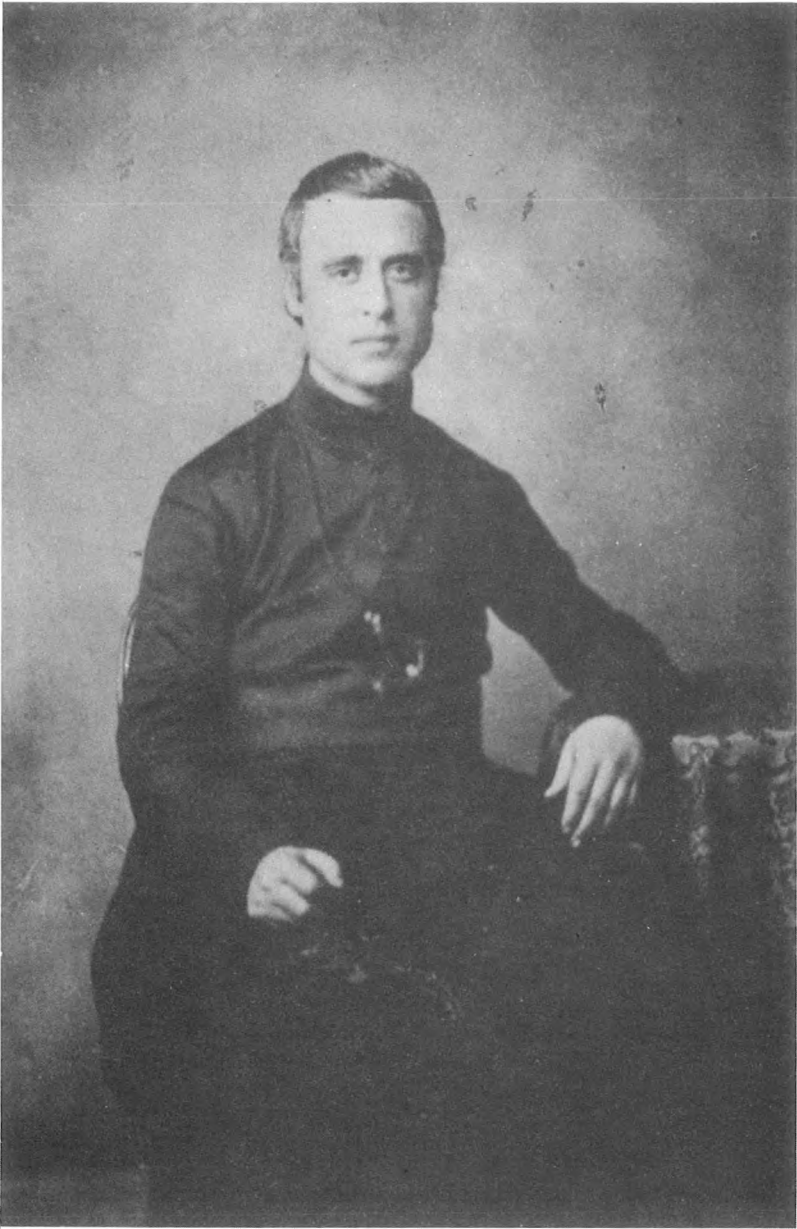
Father Charles Barthélemy Bellon (Marseilles, September 13, 1814 - Bordeaux, June 28, 1861)