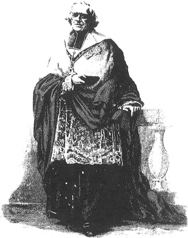
Charles Joseph Eugene de Mazenod Bishop of Marseilles Superior General and Founder of the Missionary Oblates of Mary Immaculate